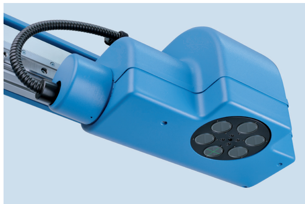
Motorized object generator for finite conjugate systems

With the collimator on the precise swinging arm an ultra-wide field angle up to \pm 105^\circ can be measured for infinity conjugate samples. An upgrade for finite testing can easily be adapted to the system with an additional motorized stage and object generator.