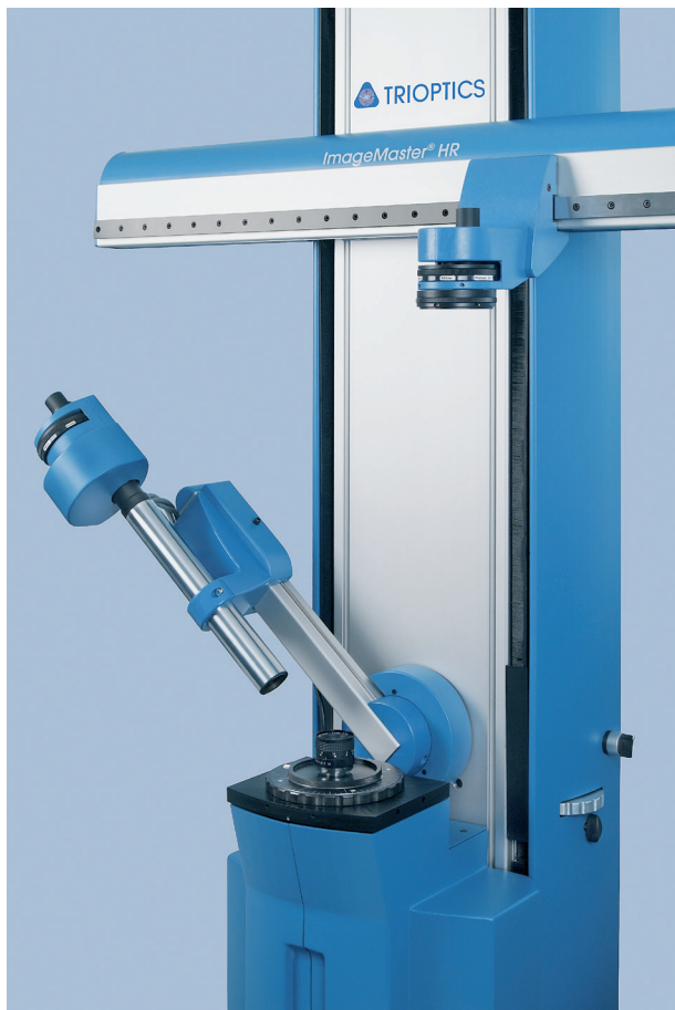
Off-axis measurement with the precise swinging arm

The ImageMaster® HR is a fully equipped R&D quality test station for medium sized sample lenses. Its modular and upgradeable design enables the measurement of the image quality (MTF) and a wide range of other optical parameters for today and future needs. The instrument is used in the R&D laboratory as well as in the quality assurance or in production. The unique vertical setup of the ImageMaster® HR is space saving and ensures the most convenient and accurate positioning of the sample lens mounts. For the majority of lenses this vertical measurement with the gravitational force along the optical axis is advantageous and easy to handle.