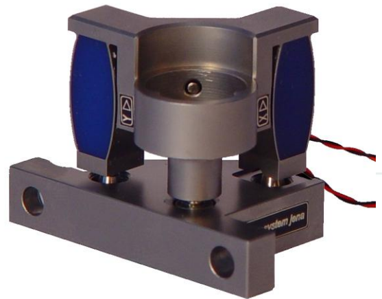
fig. 1: PKS 1-1/2" (without mirror)