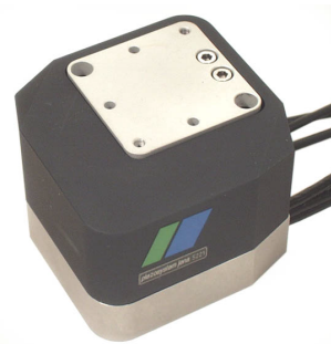
TRITOR 100 CAP

operating voltage: -10 to +150 V temperature range: -20 to 80 °C housing: stainless steel; top and bottom plate made of anodized Al connector: LEMO cable length: 1m