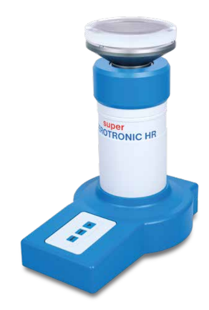
The SuperSpherotronic<sup>®</sup> HR for measuring the radius of curvature with an accuracy of up to \pm 0.01 %.

The stable tabletop devices are easily operated using the buttons built into the base. They move the encoder upwards and downwards and start the measuring process. All other settings as well as the output of the measurement results are controlled by the SpheroPRO software.