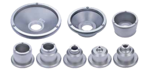
Precision rings with tungsten carbide balls for the SuperSpherotronic<sup>®</sup> HR and UltraSpherotronic<sup>®</sup>

Other ring sizes are available upon request.