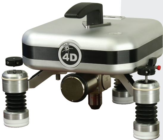
NanoCam HD with optional tripod

Utilizing a Linnik configuration, NanoCam HD interference objectives provide superior lateral resolution over a larger field of view with greater working distance and surface measurement fidelity than comparable Mirau objectives.